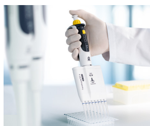
Working with PCR plates