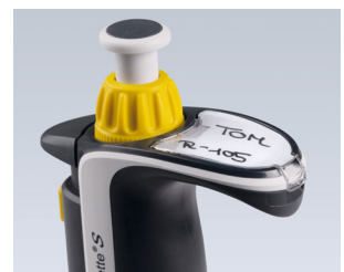
Label on the finger rest