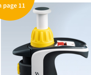
Easy Calibration technology