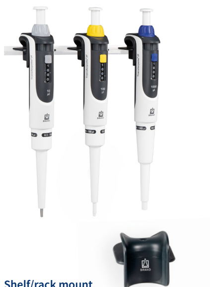
Shelf/rack mount for 1 Transferpette® S single- or multi-channel pipette.

With holders and stands, the devices are always properly stored and close at hand for the next application.