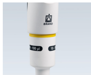
Integrated shaft coupling