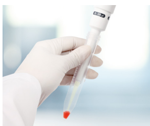
Narrow centrifuge tubes